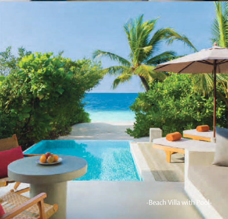
-Beach Villa with Pool-