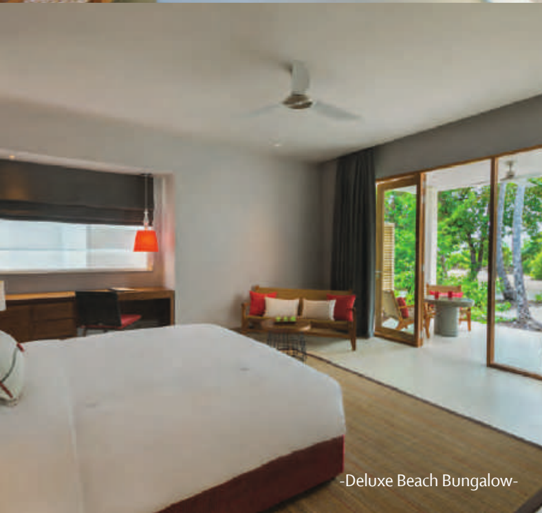
-Deluxe Beach Bungalow-