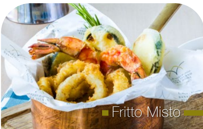
■ Fritto Misto

(N) Contains nuts (V) Vegetarian • All prices are shown in Qatari Riyal Please inquire with senior management if you have any dietary restrictions, allergies or special considerations