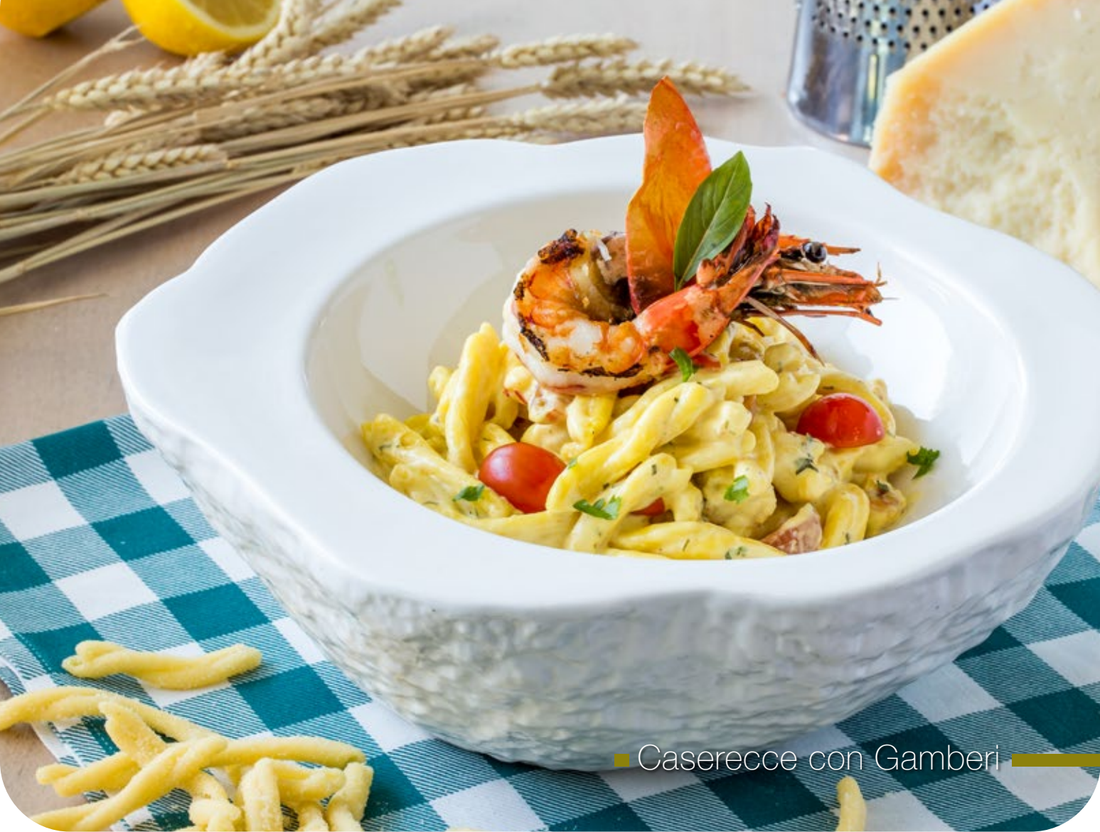
■ Caserecce con Gamberi ■