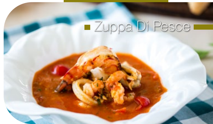
■ Zuppa Di Pesce