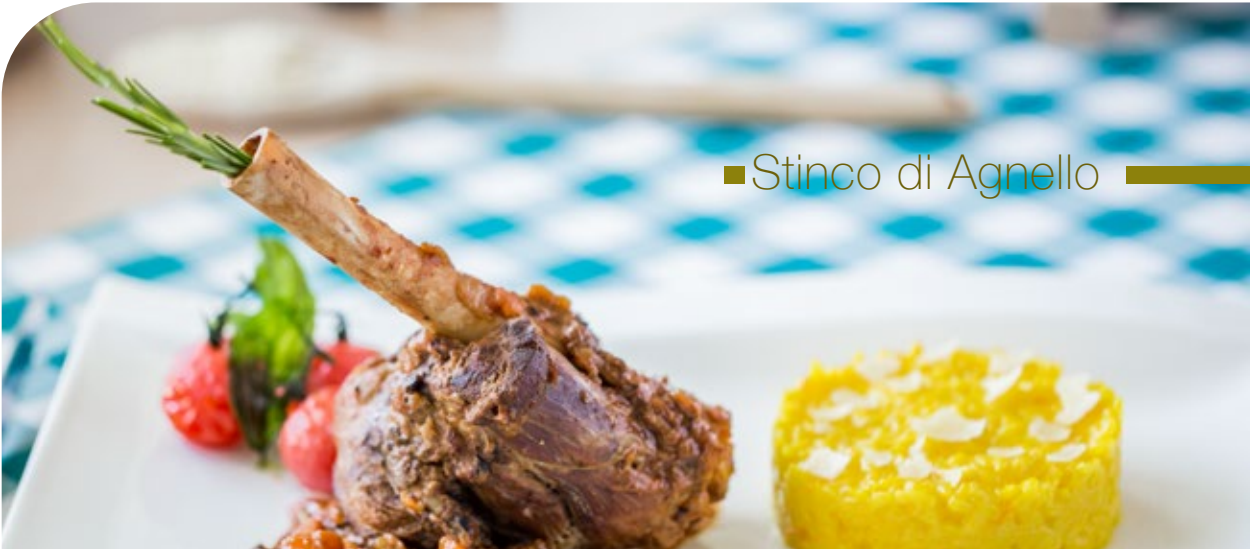
■ Stinco di Agnello ■

(N) Contains nuts (V) Vegetarian • All prices are shown in Qatari Riyal Please inquire with senior management if you have any dietary restrictions, allergies or special considerations