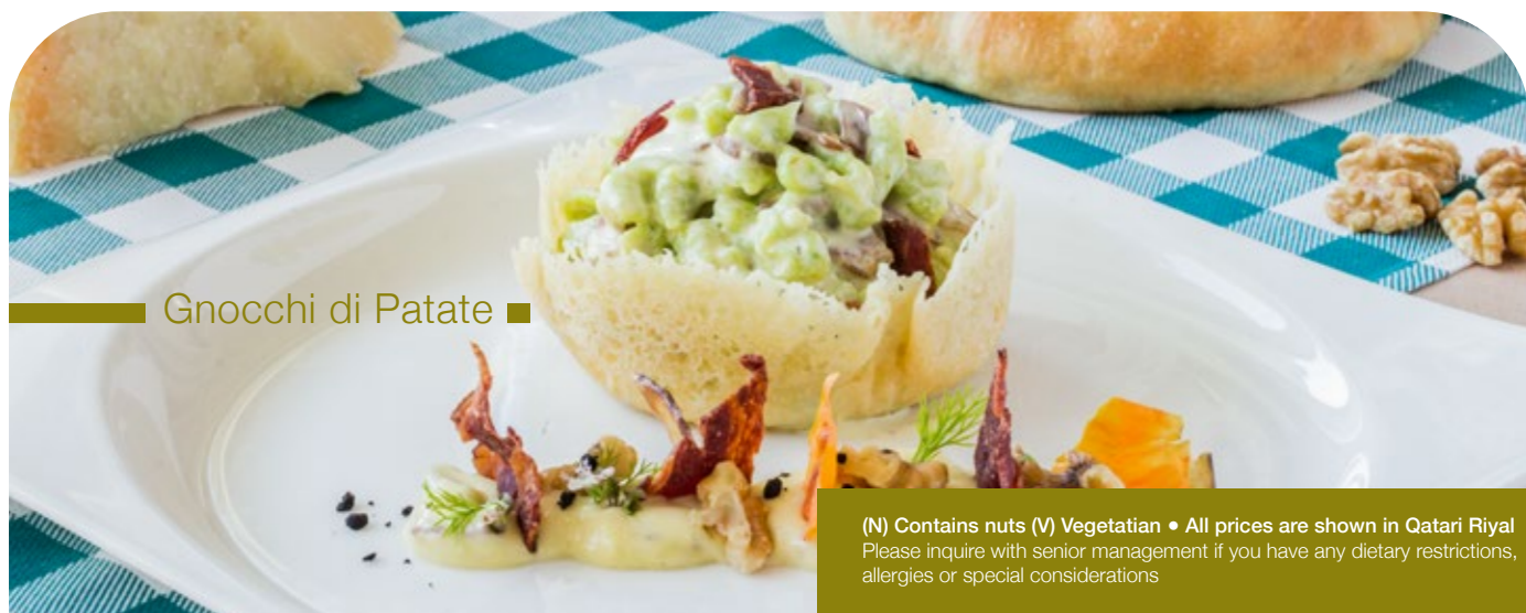
■ Gnocchi di Patate ■

Gnochetti, Beef bacon, Walnut, Cream Sauce