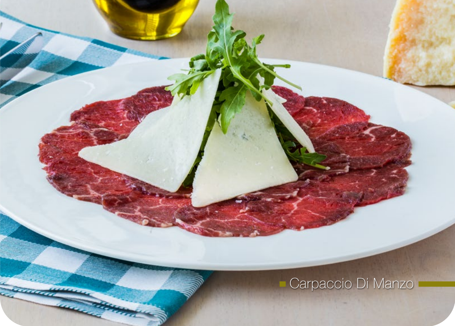
■ Carpaccio Di Manzo