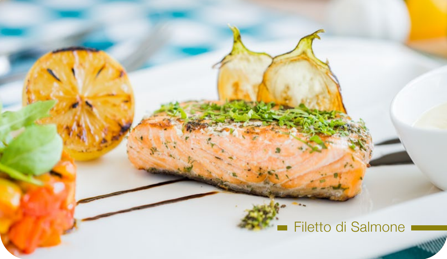
■ Filetto di Salmone ■